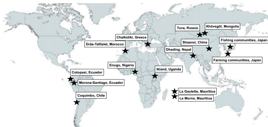
Fig. 1. Map of the 15 field sites.

Between-Community Results. The shame system evolved for making decisions in—and tracking the values of—one's local group (13; see also ref. 63), and so cultures could potentially differ from each other to an arbitrarily large degree in what is shameful and devalued. Indeed, some actions, traits, and situations elicit devaluation in some cultures but not others (13, 64). Furthermore, a rich literature in anthropology and cultural psychology exists on cultural differences in emotion, although this work seldom addresses cross-cultural similarities or questions of functional